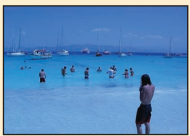
No5 NewsLetter Paxos 2004